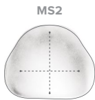
8"W x 8.5"H