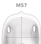
10"W x 12"D