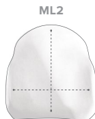
10"W x 11"H