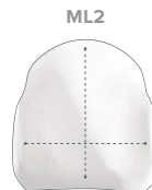
10"W x 11"H