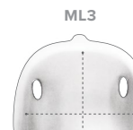
12"W x 13"D