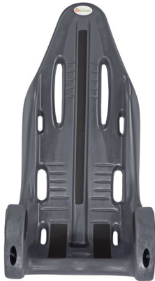
Small Shell (MS)