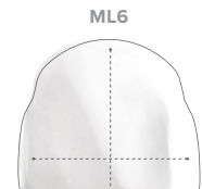
13"W x 13"H