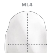
11"W x 13"H