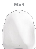
9"W x 11"H