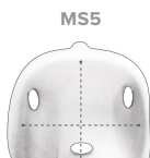
10"W x 10"D