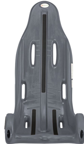
Large Shell (ML)

Choose a Shell size to determine your options