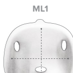
11"W x 11"D