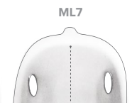
13"W x 17"D